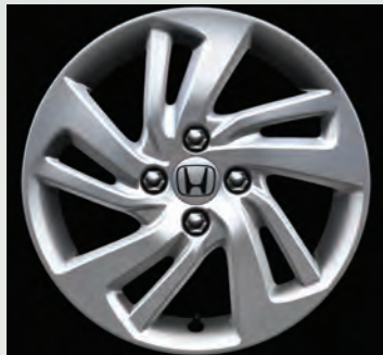
Elegance models are fitted with the above alloy wheel