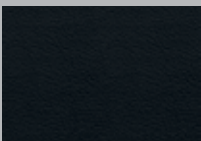
SEMI-ANILINE LEATHER BLACK