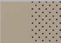
SEMI-ANILINE LEATHER IVORY

Welcome to the growing group of value-conscious people who drive Lexus. We are proud of the advanced engineering and quality construction of each vehicle we build.